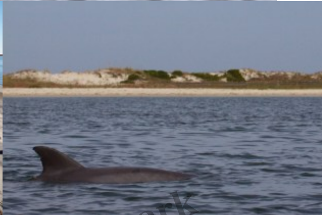
We're not out

there fifteen minutes when we see more dolphins. We paddle towards them and suddenly they're everywhere. They're swimming towards us, in front of us, behind us, next to us. When they get just so close, they swim away from us. We paddle towards them again and we are surrounded again. Then, they swim towards the beach, and some of them are jumping out of the water. A couple has arrived at the beach. We continue to paddle around, chasing the dolphins multiple times. The Zoik is handling beautifully in