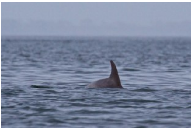
The sun is getting low in the sky, so we paddle in. We