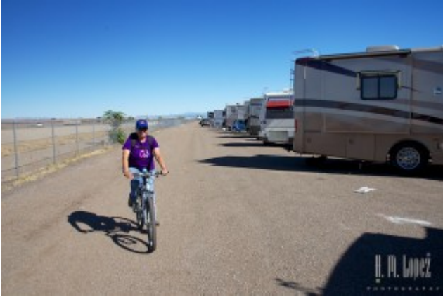
on Fiesta Park:

The down side is that the RV facilities are basically a big gravel parking lot. Not extremely friendly for pets (see Pets category below), and not scenic. On the plus side, there is a water truck that drives throughout the park constantly spraying water on the ground, which really helps to keep the dust down and the park becomes extremely scenic when the balloons fly above and around your rig and/or land in front to it.