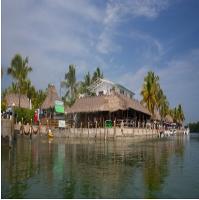
The Conch Republic